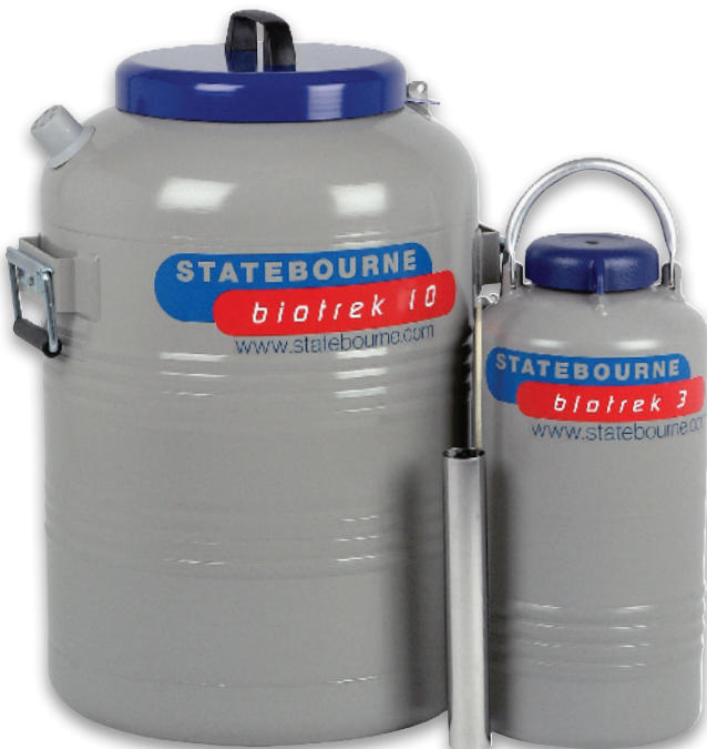
Storage system not included with the Biotrek 10.

A temperature Logger Alarm can be fitted to travel with the Biotrek units to provide a continuous record of transit temperature.