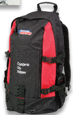
Backpack for the Biotrek 3. Part Number 9701011.