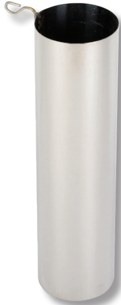
Biotrek 10 cannister system (x4)