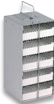
Cryobox rack system (5x 100 cell cryoboxes). Part Number 5801272.