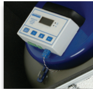
Temperature Alarm and Datalogger. Part Number 9701321.