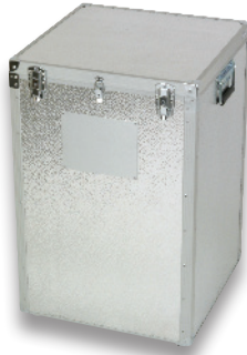
Shipping Case Biotrek 3. Part Number 9701178.