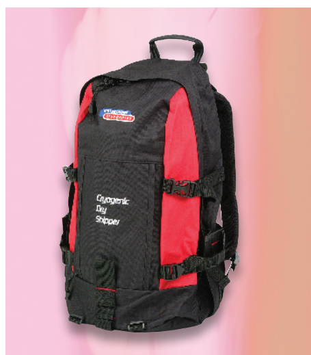
A Backpack for the Biotrek 3 is available for easy transport.

The cryo-absorbant inner foam will hold the liquid nitrogen within the vessel no matter what orientation the Biotrek may be during shipping.