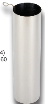
Biotrek 10 canister system (x4) Part Number 5801160

Statebourne Cryogenics 18 Parsons Road, Parsons Industrial Estate, Washington, Tyne and Wear NE37 1EZ England.