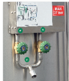
Single point top/bottom fill