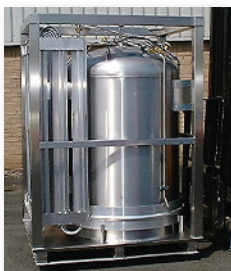
Fork lift handling