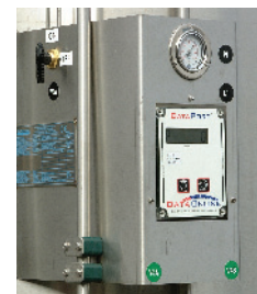
Telemetry gauges for remote monitoring