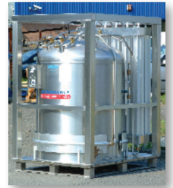
Cryocyl 600/37 High Flow