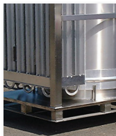
4 direction pallet base