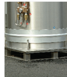
Integrated pallet base for ease of handling during installation

Statebourne Cryogenics 18 Parsons Road, Parsons Industrial Estate, Washington, Tyne and Wear NE37 1EZ England.