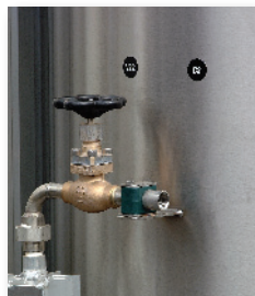
Gas use point ready for connection