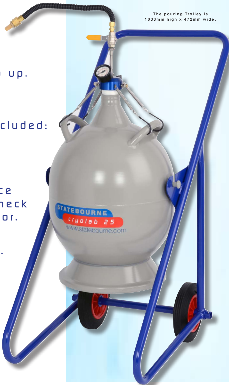
The pouring Trolley is 1033mm high x 472mm wide.

When ordering request Part number 9901133