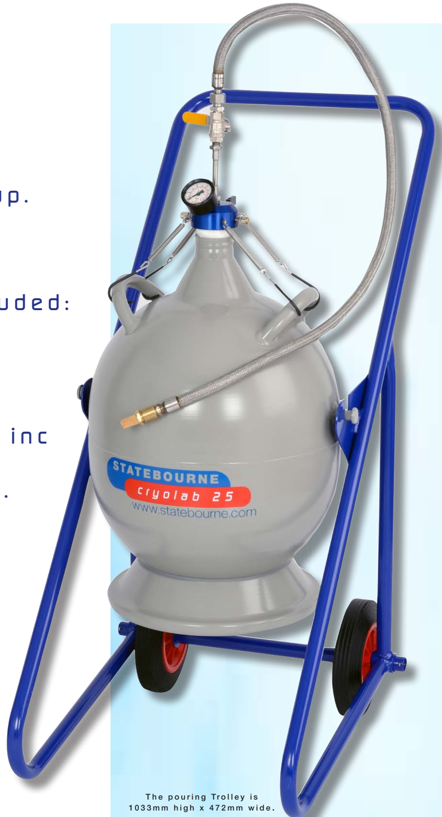
The pouring Trolley is 1033mm high x 472mm wide.

When ordering request Part number 9901132